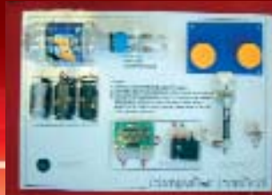
fig 1 IQ controller Ball Launcher