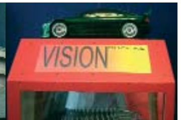
Various PIC based Point of Sale displays