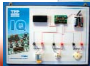
Examples of Damian's wall mounted teaching boards