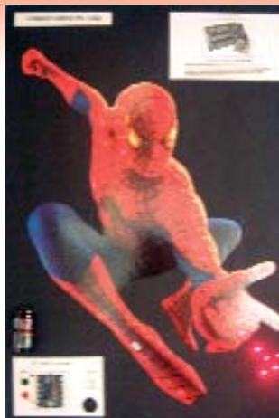
'Spidey' and 'Monsters Inc' Cinema point of sale displays